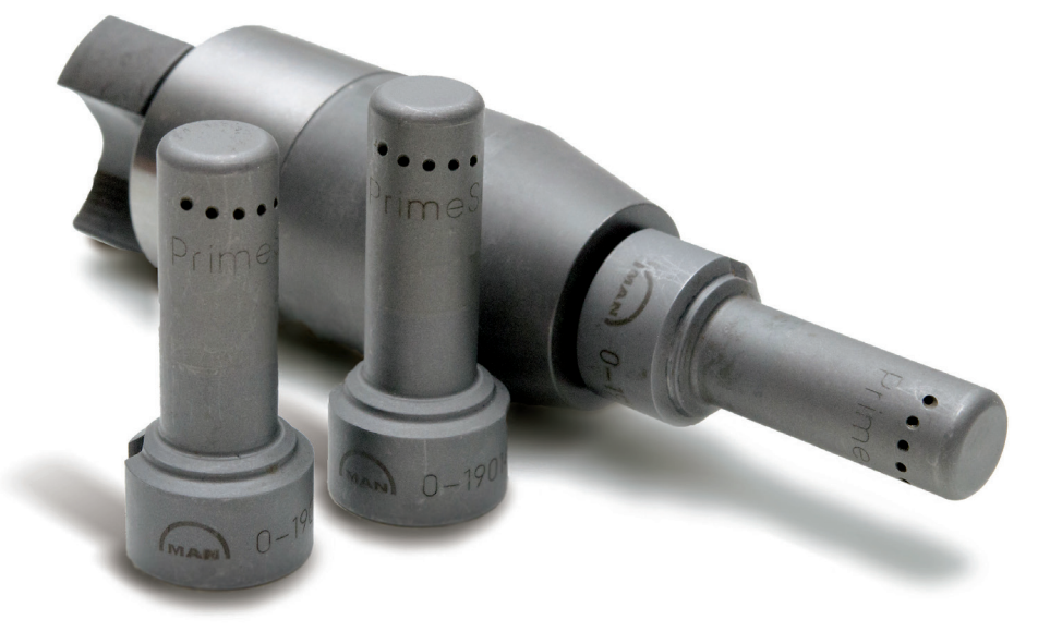
Fig. 1: MAN EcoNozzle

The MAN EcoNozzle is a complete retrofit solution. The Scope of Supply contains the new MAN EcoNozzles with spindle guides as well as a new cleaning tool and an amendment to the existing Technical File. Hence, the MAN EcoNozzle package is ready to be installed as a complete retrofit solution!