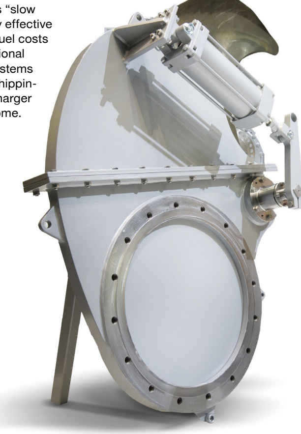
Fig. 3: Turbocharger Cut-Out