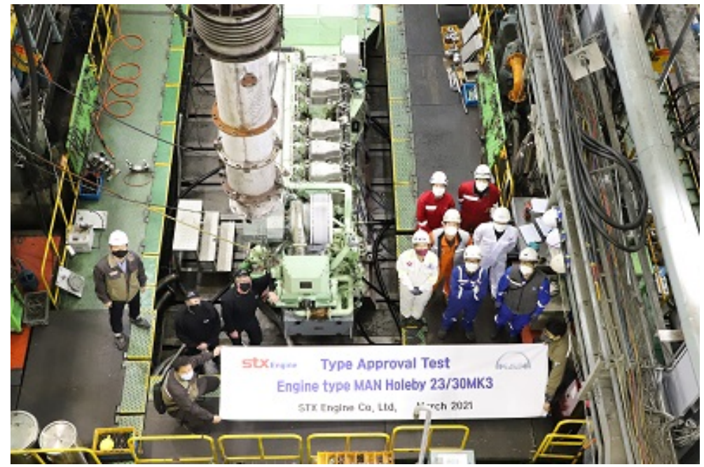
Screen grabs from the remote TAT; TAT personnel pictured by the 23/30H Mk3 engine

MAN Energy Solutions enables its customers to achieve sustainable value creation in the transition towards a carbon neutral future. Addressing tomorrow's challenges within the marine, energy and industrial sectors, we improve efficiency and performance at a systemic level. Leading the way in advanced engineering for more than 250 years, we provide a unique portfolio of technologies. Headquartered in Germany, MAN Energy Solutions employs some 14,000 people at over 120 sites globally. Our after-sales brand, MAN PrimeServ, offers a vast network of service centres to our customers all over the world.