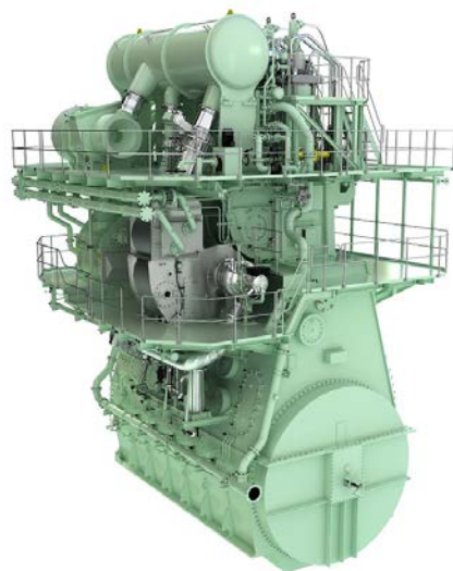
Rendering of a 5G70ME-GA engine

The New ME-GA dual-fuel engine was unveiled during a livestream from MAN Energy Solutions' Research Centre Copenhagen on March 18 th , 2021. The new engine is an Otto-cycle variant of the company's successful ME-GI engine