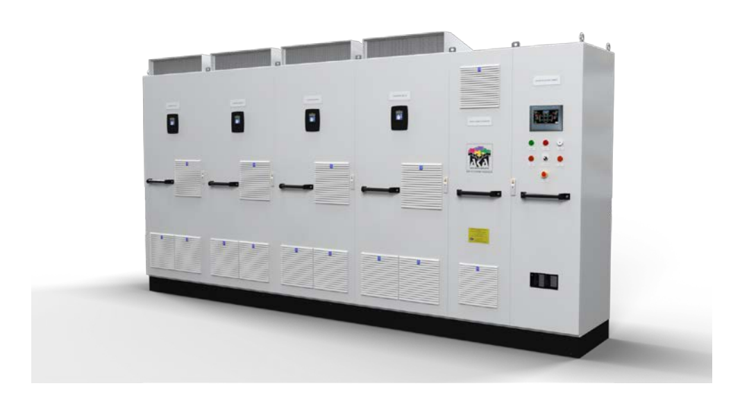
The AKA HyProp frequency converter

MAN Energy Solutions enables its customers to achieve sustainable value creation in the transition towards a carbon neutral future. Addressing tomorrow's challenges within the marine, energy and industrial sectors, we improve efficiency and performance at a systemic level. Leading the way in advanced engineering for more than 250 years, we provide a unique portfolio of technologies. Headquartered in Germany, MAN Energy Solutions employs some 14,000 people at over 120 sites globally. Our after-sales brand, MAN PrimeServ, offers a vast network of service centres to our customers all over the world.