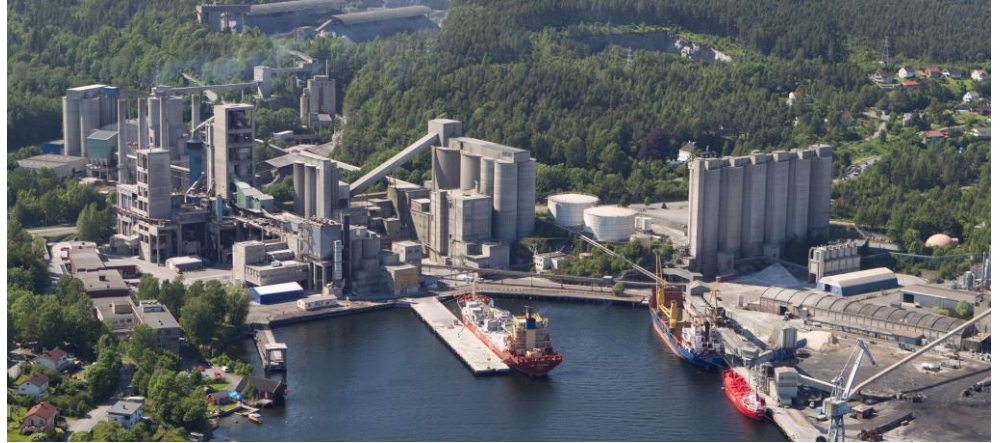
Aerial view of the cement factory in Brevik, Norway

MAN Energy Solutions enables its customers to achieve sustainable value creation in the transition towards a carbon neutral future. Addressing tomorrow's challenges within the marine, energy and industrial sectors, we improve efficiency and performance at a systemic level. Leading the way in advanced engineering for more than 250 years, we provide a unique portfolio of technologies. Headquartered in Germany, MAN Energy Solutions employs some 14,000 people at over 120 sites globally. Our after-sales brand, MAN PrimeServ, offers a vast network of service centres to our customers all over the world.