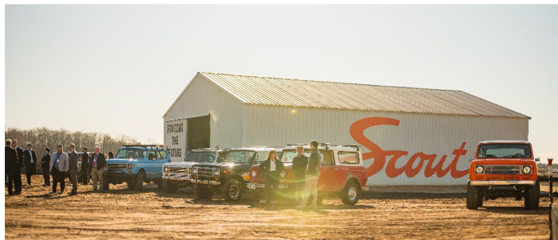
Scout Motors is re-energizing the original ingenuity of the rugged off-roader and electrifying its future. The broke ground on its new Production Center company on February 15, 2024.