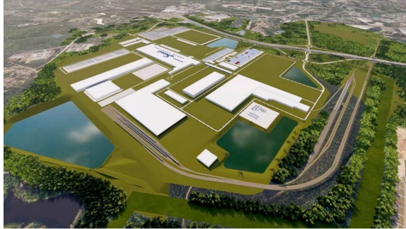
At its peak, over 200,000 vehicles per year will be produced at the Scout Motors Production Center in Blythewood, South Carolina.